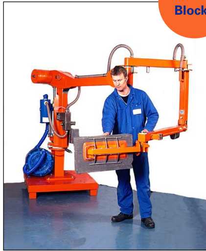
Manipulator - suitable for low headroom situations