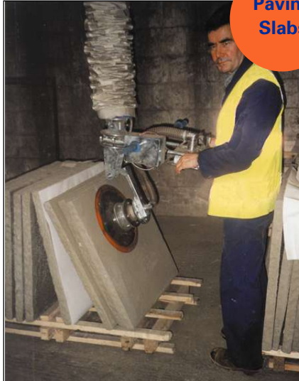
Vacuum Lifter - with 90° rotation